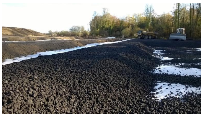
NOTEX GX 400-50 in the embankment