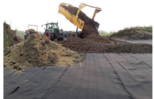
Filling on SOMTUBE FTF