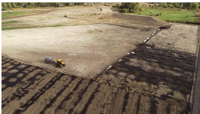
Aerial view of SOMTUBE FTF installation