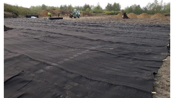
SOMTUBE FTF installation on support soil