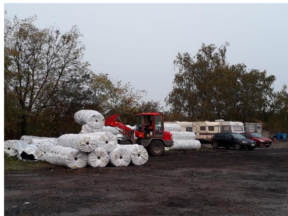
Storage of SOMTUBE FTF on site

The SOMTUBE FTF is delivered in rolls of 3,90m wide for 50 to 70m long inside a plastic package UV-Resistant. NOTEX GX 400-50 is delivered in rolls of 5,30m wide for 100m long.