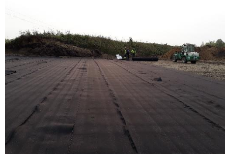
Installation of rolls, manutention and layout